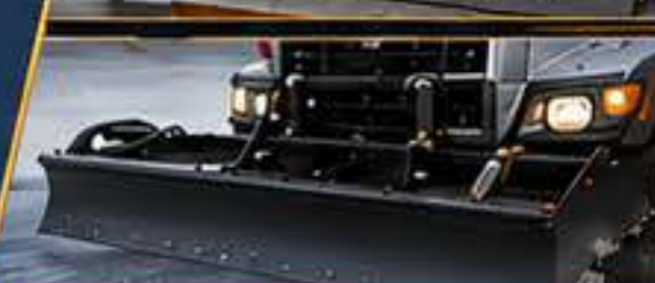
MOUNTING & STRUCTURAL COMPONENTS