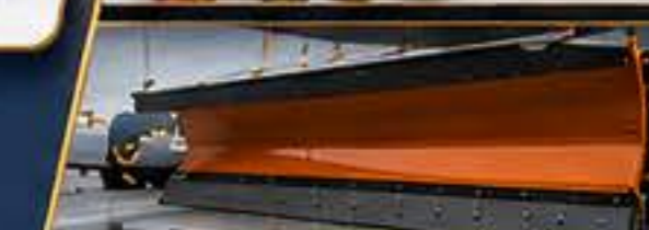
PLOW BLADES & WEAR PARTS