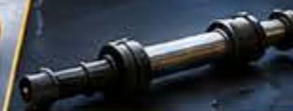
HYDRAULIC CYLINDERS & SYSTEMS