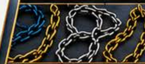
CHAIN, DRIVE & MECHANICAL SYSTEMS