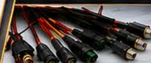
ELECTRICAL & CONTROL SYSTEMS