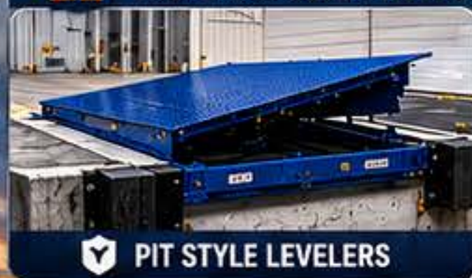
PIT STYLE LEVELERS