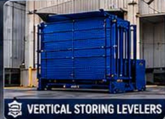
VERTICAL STORING LEVELERS