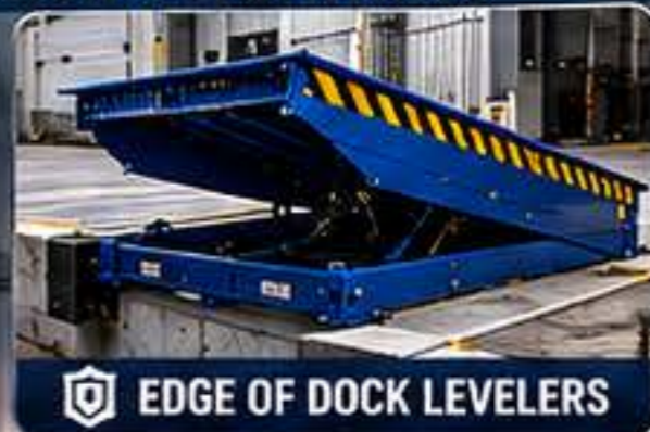
EDGE OF DOCK LEVELERS