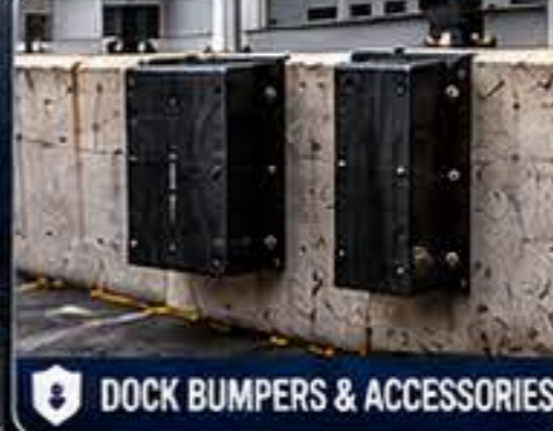
DOCK BUMPERS & ACCESSORIES