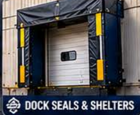
DOCK SEALS & SHELTERS