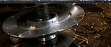
SPINNER & DISC SYSTEMS