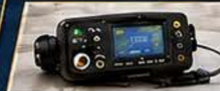
CONTROL SYSTEMS & ELECTRONICS