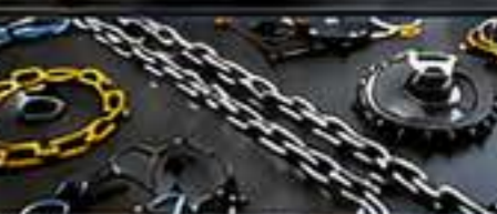
CONVEYOR, CHAIN & DRIVE SYSTEMS