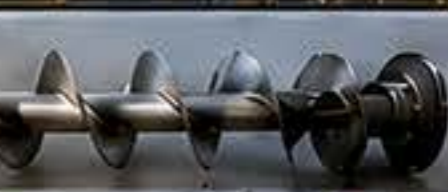
AUGERS & FLIGHTING