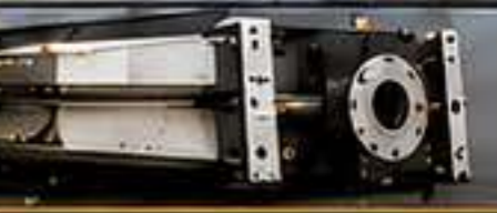
GATES, CHUTES & STRUCTURAL PARTS