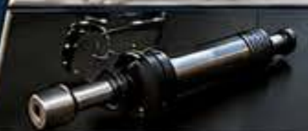
HYDRAULIC SYSTEMS & COMPONENTS