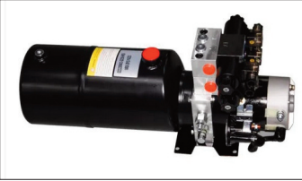
HYD. POWER PACK