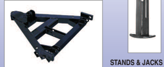
STANDS & JACKS