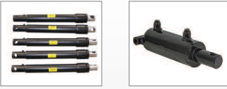
500 HRS SALT SPRAY FOR CHROME PLATED BARS 500 HRS SALT SPRAY FOR CYLINDER HOUSING 200 HRS SALT SPRAY FOR CHROME PLATED BARS 500 HRS SALT SPRAY FOR CYLINDER HOUSING