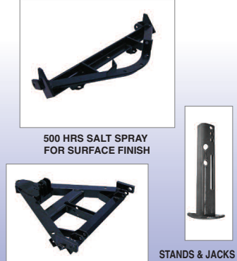
500 HRS SALT SPRAY FOR SURFACE FINISH