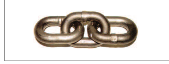
NACM STANDARDS GRADE 43 HIGH TEST CHAIN